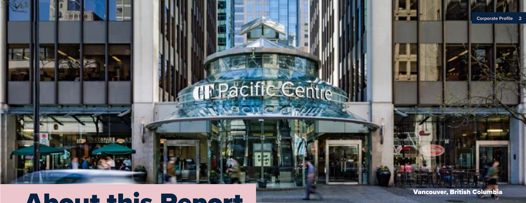
Vancouver, British Columbia